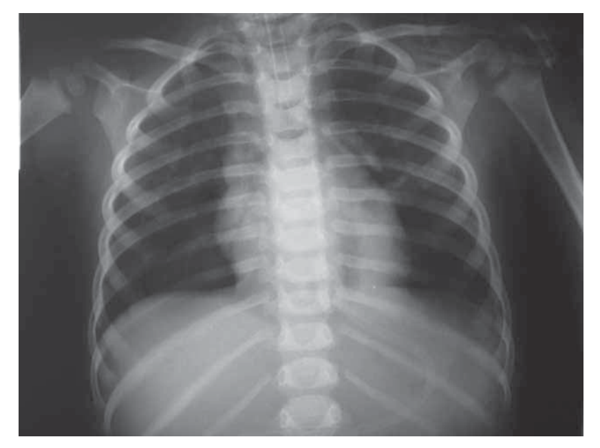
Figure 1. Chest X-ray.

structure and appearance of the epiglottis, trachea and larynx covered with purulent, viscous secretions and pus; tracheal mucosa being vulnerable, oedematous and hemorrhagic, indicating tracheitis as a cause of the airway obstruction. Pulmonary basal hyperinflation with segmental atelectasis of the upper left lobe became evident on the X-ray (figure 1). Mechanical ventilation was maintained using several controlled and assisted modes in order to wean which was accomplished on the 9<sup>th</sup> day.